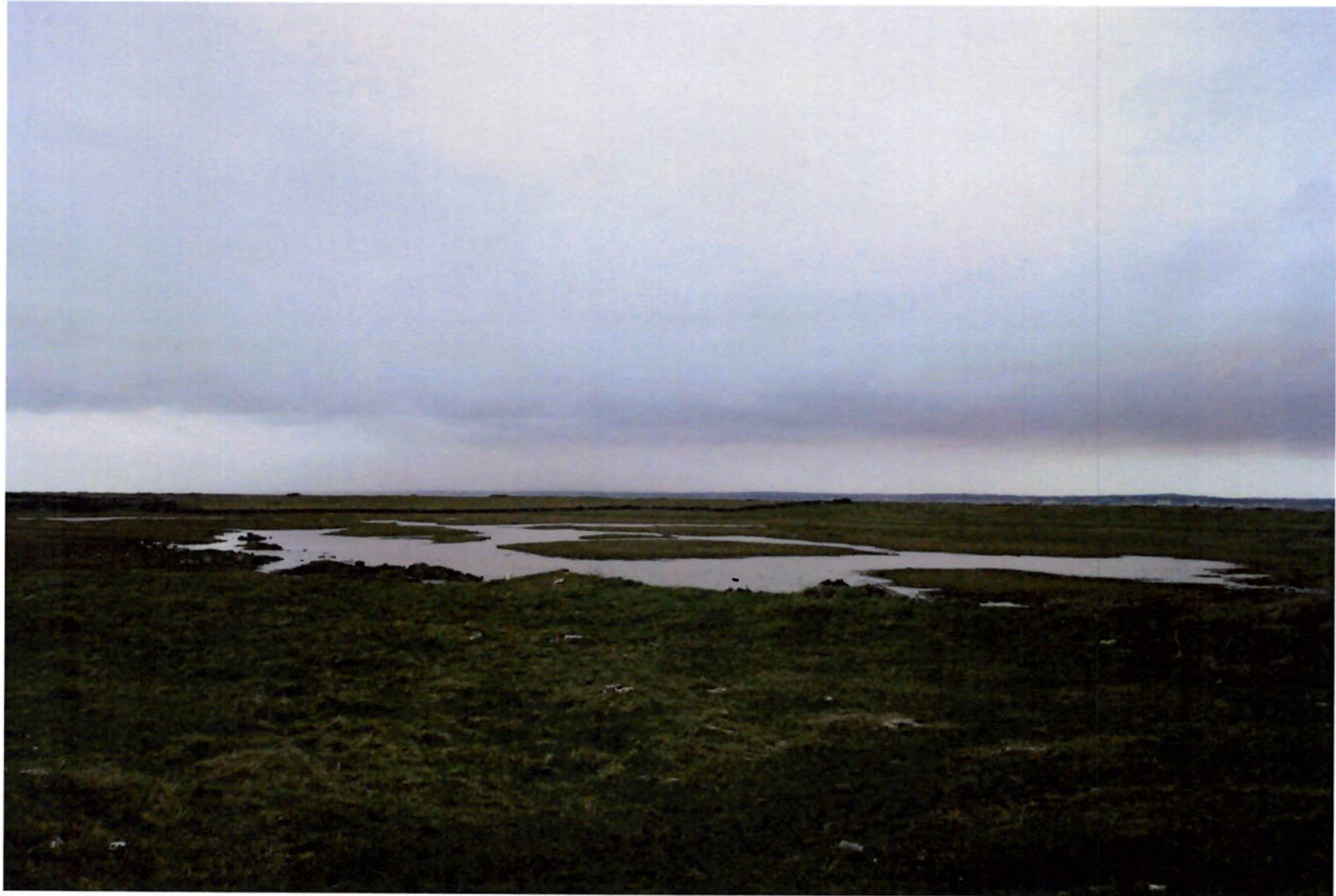
Photo 13 - View northwest across salt marsh at Tawin Island.