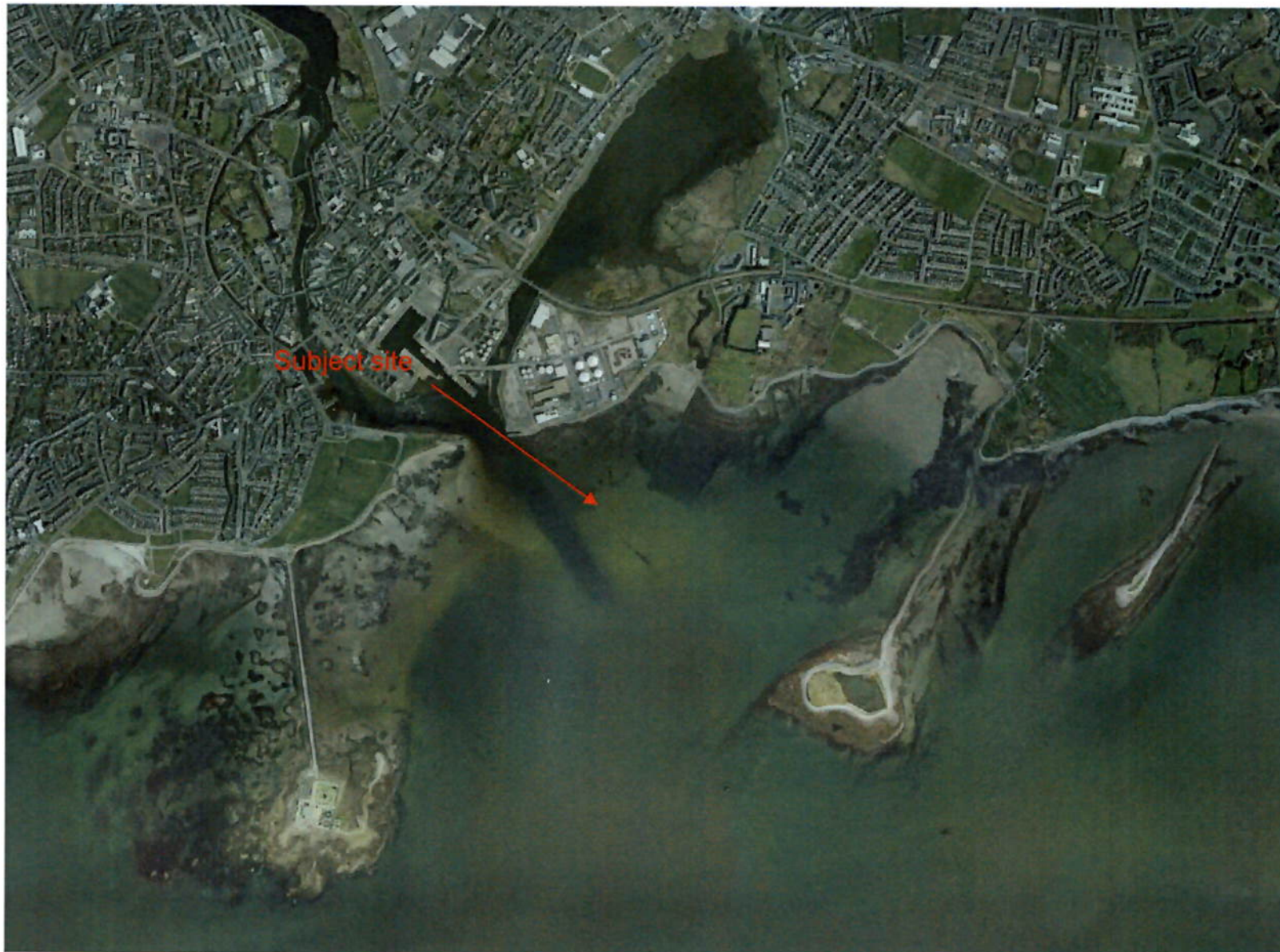
Aerial photograph of the site